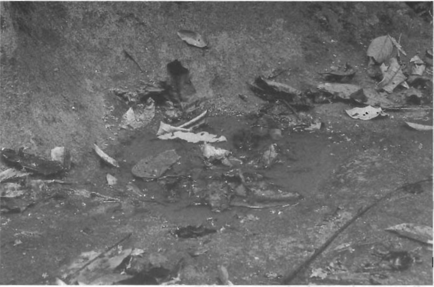
Fig. 2. Jungle track from Tekek to Juara, primary forest, Sungei Ayer Besar, 200 - 270 m. Small, shallow and shaded rock pool. The habitat of Lacconectus corayi , L. krikkeni and the larvae of Scirtidae.