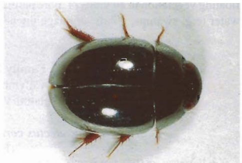
Fig. 5. Oocyclus sumatrensis tiomanensis Hebauer & Wang, 1998 (Body length, 3.5 mm).