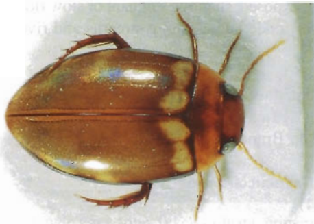
Fig. 4. Lacconectus corayi Brancucci, 1986 (Body length, 3.6 mm).

Distribution. - Peninsular Malaysia: Pulau Tioman and Pulau Langkawi (Hebauer & Wang, 1988).