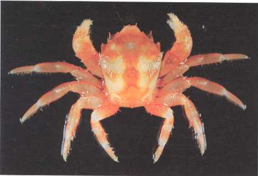
Fig. 2. Paratymolus taiwanicus , new species. Holotype male (cl 7.4 mm) (ZRC) Dorsal view. Life colour.

In the specimens of P. latipes examined, numerous tubular sensory setae were present on the anterior region of the carapace, orbital region, rostrum and in a straight row along the most