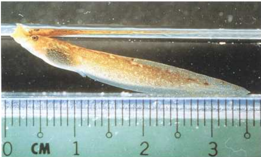
Fig. 2. Lateral aspect of Megophrys longipes larva (Stage 32) in feeding position.