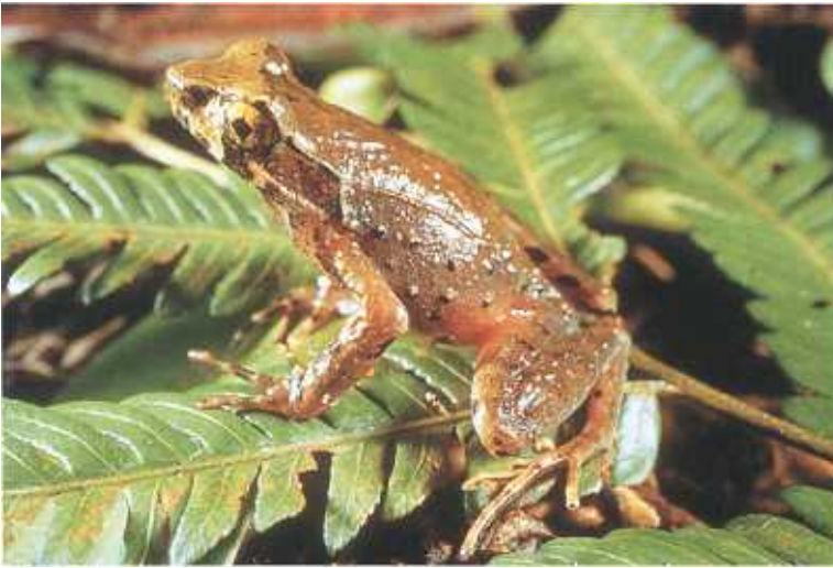
Fig. 1. Lateral view of adult Megophrys longipes Boulenger (ZRC.1.3460), Fraser's Hill, Peninsular Malaysia.

Feeding Behaviour. - At the hill streams, the larvae were observed to feed in a manner similar to that seen in Megophrys nasuta larvae. In shallow water (<1 cm depth), the M. longipes larvae contact the water surface with fully expanded funnel lips, forming a noticeable depression of the water surface at the position of the mouth (Fig. 2). With swift gulping