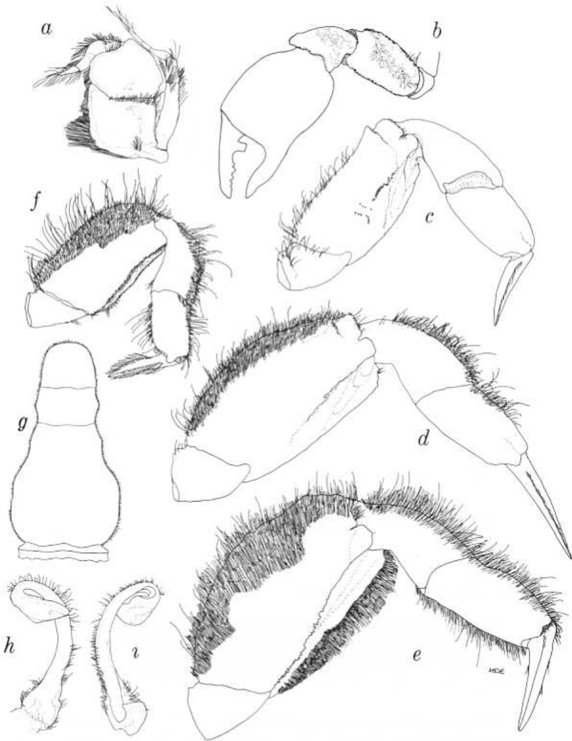
Fig. 2. Paracleistostoma depressum De Man, 1895. Male, cl 7.8 mm, Santu: a, third maxilliped; b, cheliped; c, P2; d, P3; e, P4; f, P5; g, abdomen; h, i, gonopods.