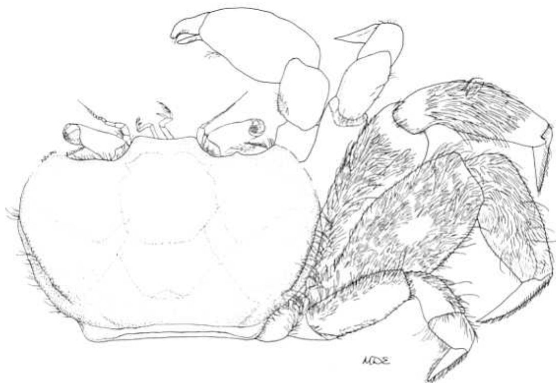
Fig. 1. Paracleistostoma depressum De Man, 1895. Male, cl 7.8 mm, Santu.

unarmed. Shallow, U-shaped groove present on mesogastric region, hepatic region and each side of intestinal region with shallow depression. Front subquadrate, deflexed, appearing transverse in dorsal view, concave medially in frontal view; indistinct epigastric ridges present at base of front. Orbits broad, sinuous, lacking incision dorsally; suborbital ridge forming lower margin of orbit, true suborbital margin present as line of granules in orbit. Lateral margin of carapace defined by raised, granulate ridge, ridge terminating posterolaterally above true margin at level of fifth pereopods. Transverse ridge present posteriorly just ahead of posterior margin.