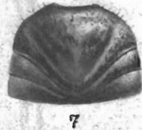
Thelyphonus kinabaluensis .