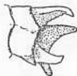
Text-fig. 1 Anal appendages from above. (Flattened and distorted. Camera Lucida).

Differs from other species, so far as known to me by the regularly incurved upper anal appendages. The female is not yet known.