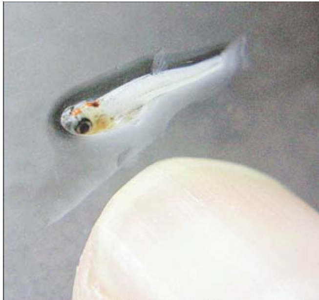
A species of the world's smallest fish (compared against a finger) found in a peat swamp in Dungun.

The first freshwater specimen, Paedocypris megamegenethes, was found in Kuching and Bukit Merah, Perak, in 2001. The second, identified as Paedocypris progenitica, was found in Sumatra in 2004.